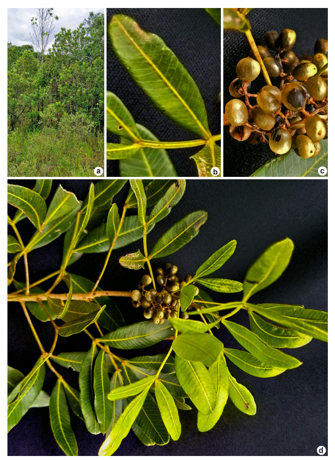
Figure 2 – a-d. Lithraea molleoides – a. habit; b. detail of the winged rachis; c. detail of mature fruits; d. terminal branch with mature fruits (a-d: photos of the specimen Panizza & Hentz 154 by E. Hentz).