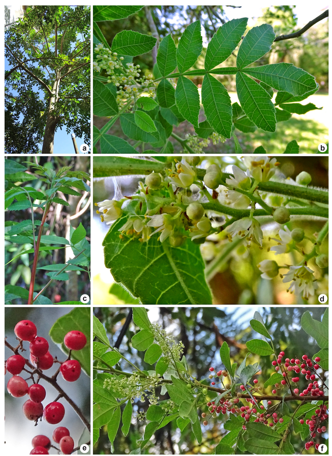
Figure 4 – a-f. Schinus terebinthifolia – a. habit; b. terminal branch with inflorescences and leaves with detail of the winged rachis; c. reddish young apical branch; d. inflorescence detail; e. mature fruits; f. branch with inflorescences and inmature and mature fruits (b and d: photos of the specimen Panizza 244, and photos of a-f by A.M. Panizza)..