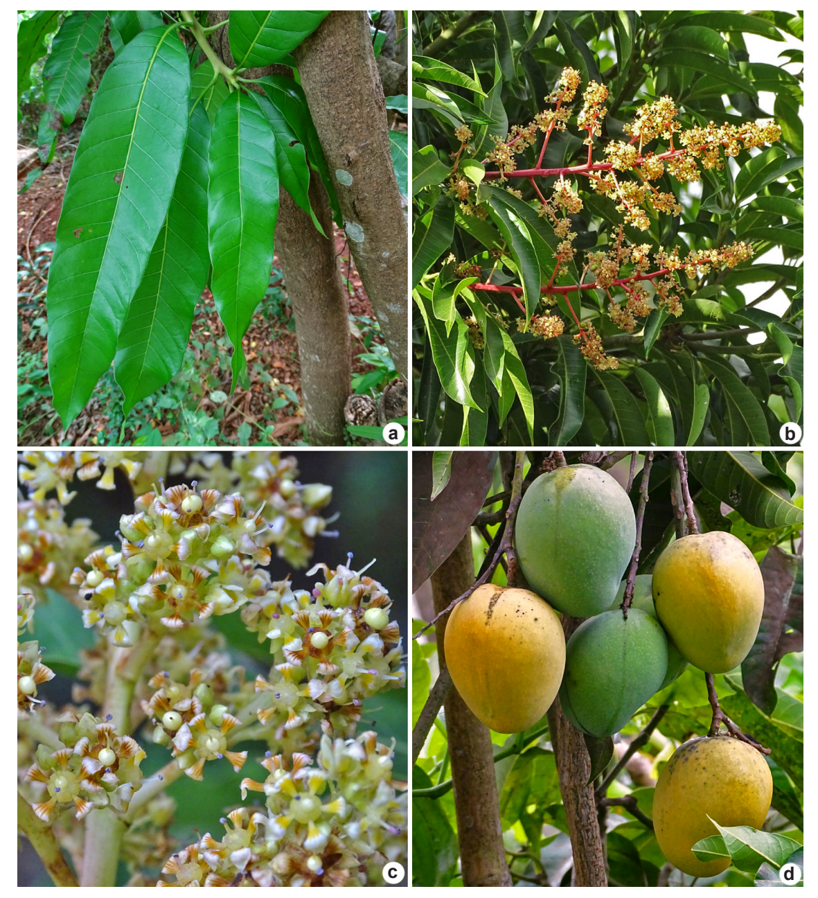
Figure 3 – a-d. Mangifera indica – a. leaves; b. terminal branches with inflorescences; -c. detail of the inflorescence; d. immature green and mature yellow fruits.

The epithet refers to the origin of the species or states that it was published based on a specimen originated from India (González 2021).