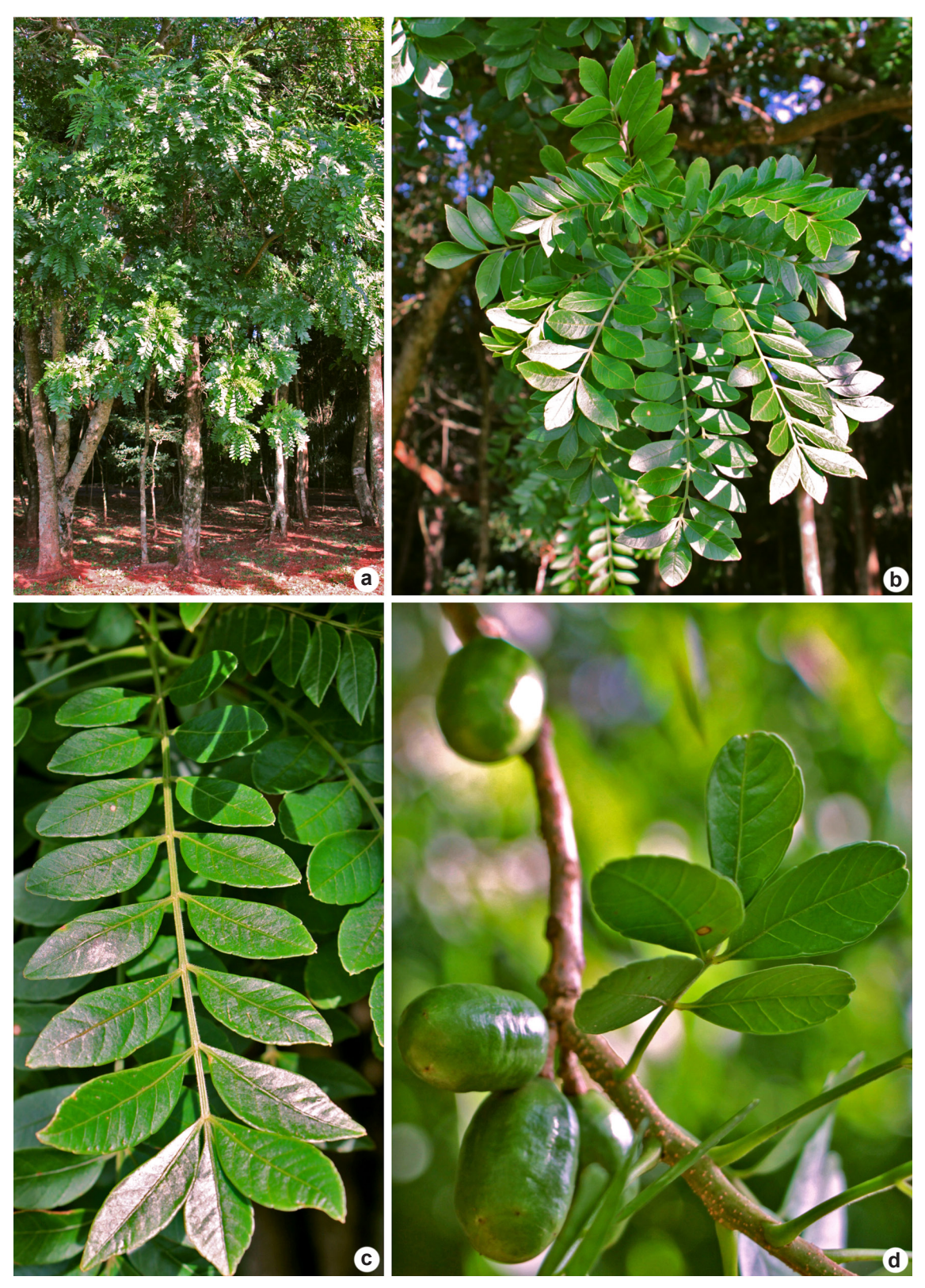
Figure 5 – a-d. Spondias purpurea – a. habit; b. branch; c. leaf; d. leaflets with intramarginal vein and inmature green fruits (a-d: photos of the specimen Panizza & Vieiras 201).