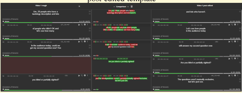
Figure 4: Subtitle editor with the raw subtitle template and the post-edited template

principles and split up structures that should always appear together (e.g., "lots of people", "are you (...)"). Participants claimed that the segmentation of the dialogue was not conducive to a comfortable reading of the subtitles either, and they, therefore, needed to merge and remove many subtitles (see crossed-out red box on the left-hand side of Figure 4).